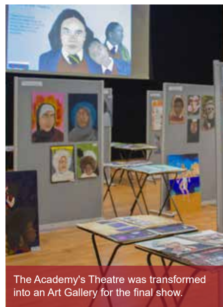
The Academy's Theatre was transformed into an Art Gallery for the final show.

The diversity in artwork across this exhibition is a reflection of the students' independence. A large amount of the artwork on display is about important, often personal issues and has been explored sensitively but powerfully. When looking across the exhibition, the sense of pride and achievement from the hard work of all our students really shone through. All of our artists can feel incredibly proud of their achievements and the strong trajectory for their futures. ■