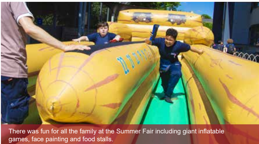
There was fun for all the family at the Summer Fair including giant inflatable games, face painting and food stalls.