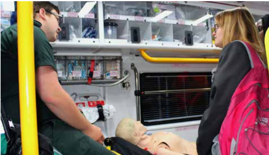
Students explored the many exhibits and activities on offer from a large number of organisations, employers and businesses, including this NHS exhibit.

On Friday 24 th June 50 excited Year 9 students from HA boarded a coach bound for the sunny Midlands. Destination; The Big Bang Fair at the NEC in Birmingham.