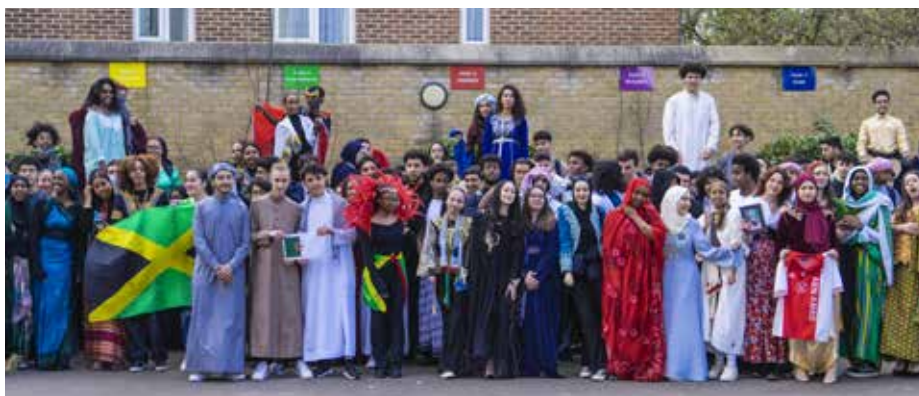
Sixth Formers led the celebrations on Culture Day.

“It was wonderful to see everyone expressing their culture through their clothes...”