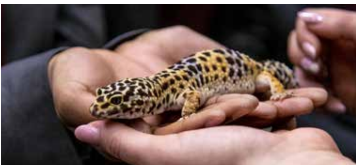
This beautiful gecko was a particular favourite amongst the students. There were many animals that students had never seen before.