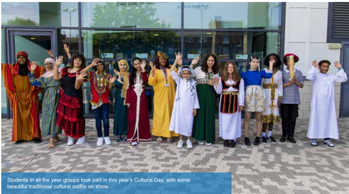
Students in all the year groups took part in this year's Cultural Day, with some beautiful traditional cultural outfits on show.

The Academy's Cultural Day is a celebration of all the different cultures found in the Academy community and to highlight the importance of diversity.