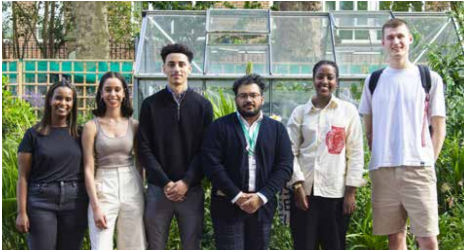
The career speakers were all under 25 and the majority are HA alumni which students found more relatable and approachable.

The end of June saw the launch of our first ever Year 7 Careers Conference, an opportunity for our youngest students to hear from six invited speakers in the early stages of their careers.