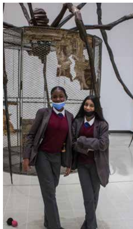
Students had a tour behind the scenes including seeing restoration work in action.