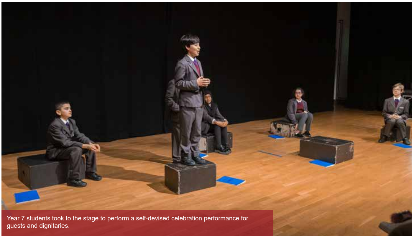
Year 7 students took to the stage to perform a self-devised celebration performance for guests and dignitaries.

each generation of students define it again. In a sense, the Academy keeps getting relaunched every year as a new group of students come in, go through the school so it's been a real joy to see it evolve beyond me and beyond my vision."