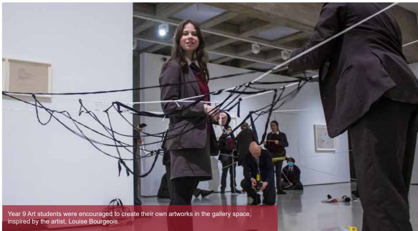
Year 9 Art students were encouraged to create their own artworks in the gallery space, inspired by the artist, Louise Bourgeois.

HAMMERSMITH ACADEMY STUDENTS TOOK OVER THE HAYWARD GALLERY FOR A DAY OF ARTISTIC DISCOVERY. YEAR 9 STUDENTS TELL US ABOUT THEIR TRIP.