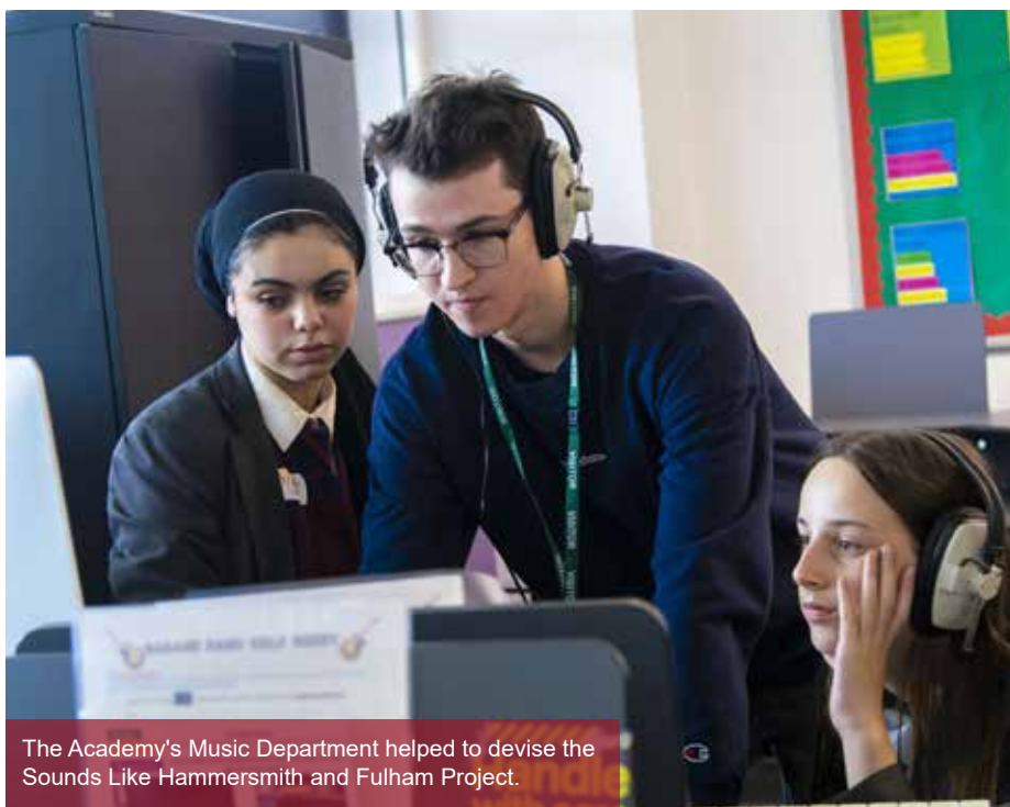
The Academy's Music Department helped to devise the Sounds Like Hammersmith and Fulham Project.