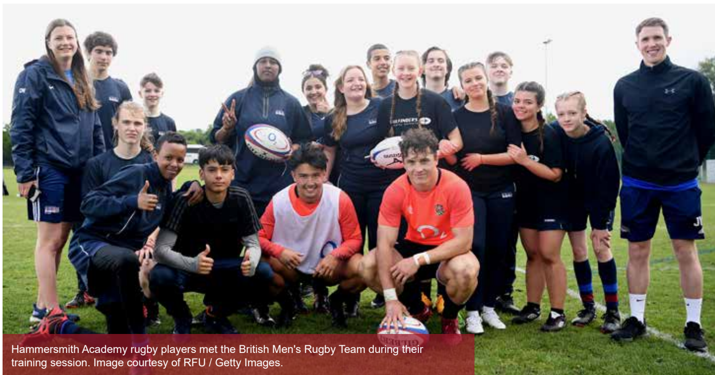
Hammersmith Academy rugby players met the British Men's Rugby Team during their training session.

THIS TERM HAS BEEN A TYPICALLY BUSY ONE FOR THE SPORTS DEPARTMENT. HERE IS A ROUND-UP OF ALL THE SPORTING NEWS.