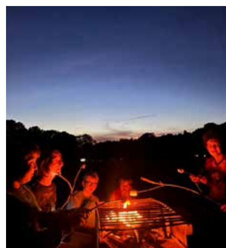
Students enjoyed the evenings outdoors by the campfire.

A huge thank you to those parents who helped out to return students after the final expedition due to the train strikes! ■