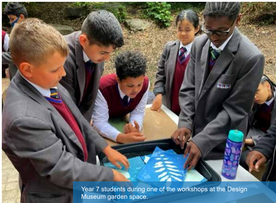
Year 7 students during one of the workshops at the Design Museum garden space.

Across the programme, students have had workshops both at The Design Museum and in the Academy. They started the project by conducting a site survey of the garden to identify what plants naturally grow in the space, which has informed their planning for future planting. Students have learnt new skills around gardening, working