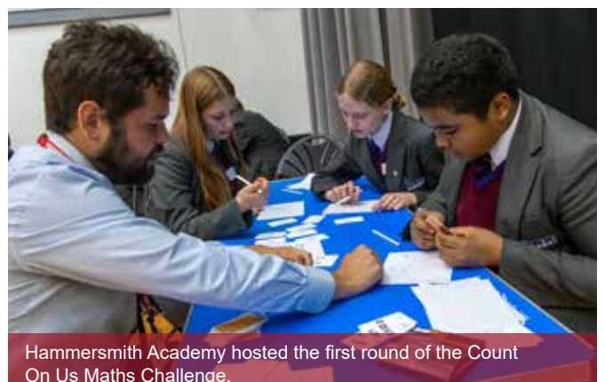
Hammersmith Academy hosted the first round of the Count On Us Maths Challenge.

Although we did not win the overall competition, it has taught us how to work around different maths challenges and problems and from this, our knowledge of maths has expanded massively, along with our teamwork. ■