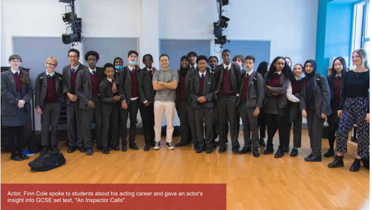
Actor, Finn Cole spoke to students about his acting career and gave an actor's insight into GCSE set text, "An Inspector Calls".

FILM AND TV ACTOR, FINN COLE GAVE YEAR 10 STUDENTS AN ACTING MASTERCLASS TO HELP BOLSTER THEIR ENGLISH GCSE STUDIES.