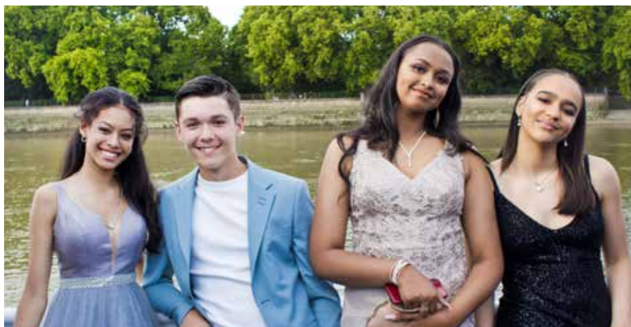
Students ran away with the evening's glamour theme as they partied on their own dedicated boat on the Thames.

YEAR 11 STUDENTS CELEBRATED THE END OF THEIR GCSE EXAMS WITH A PROM ON THE THAMES. MR FITCHETT REPORTS ON THE EVENT.