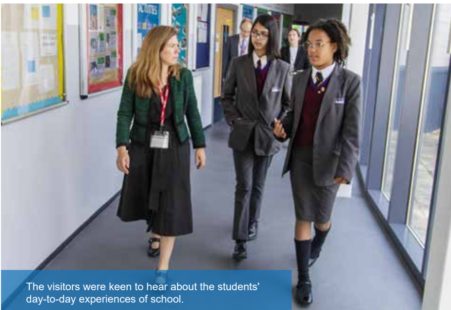
The visitors were keen to hear about the students' day-to-day experiences of school.

BOARD MEMBERS FROM THE DEPARTMENT FOR EDUCATION VISITED THE ACADEMY TO SEE POLICIES IN ACTION.