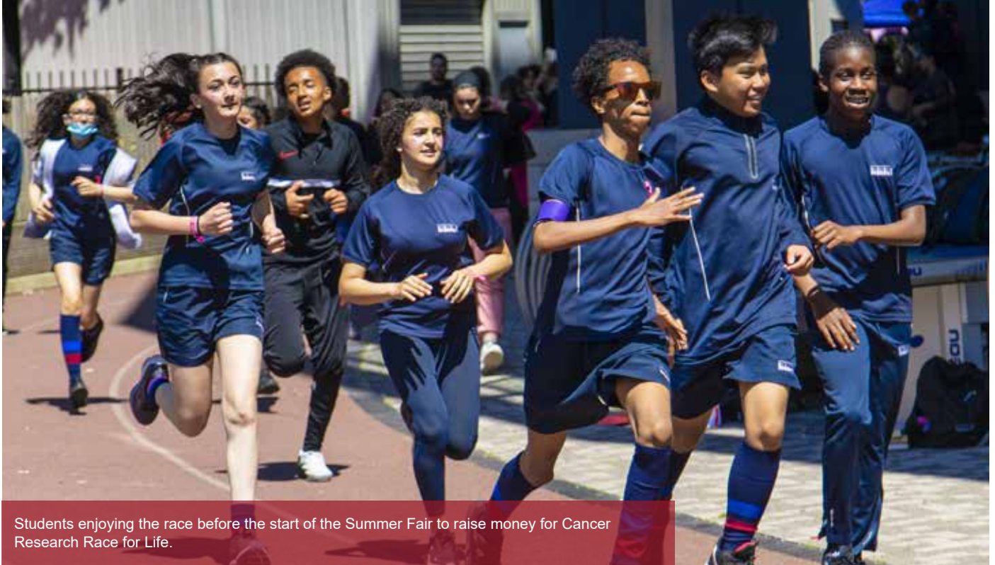
Students enjoying the race before the start of the Summer Fair to raise money for Cancer Research Race for Life.

THE ACADEMY RACE FOR LIFE SUMMER FAIR RETURNED AFTER A THREE YEAR ABSENCE TO RAISE MONEY FOR CANCER RESEARCH.