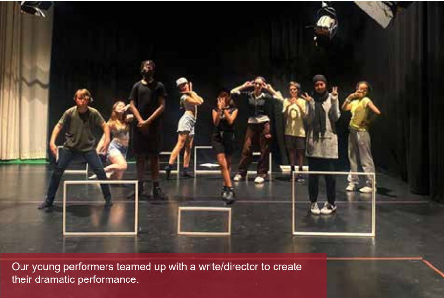
Our young performers teamed up with a write/director to create their dramatic performance.

STUDENTS TAKE TO THE LYRIC THEATRE STAGE AS PART OF THE REACT FESTIVAL.