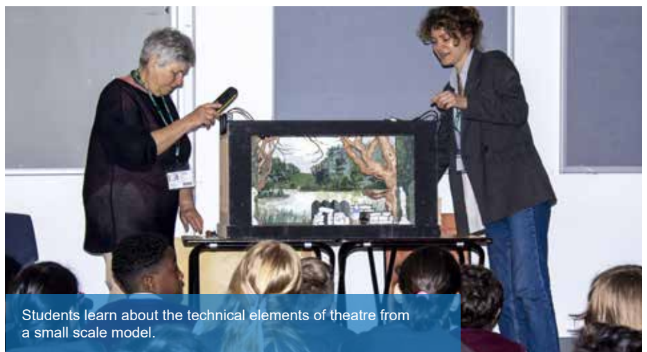
Students learn about the technical elements of theatre from a small scale model.

At the conclusion of the project, students sat down to watch their own production performed. A wonderful way to introduce young people into the world of theatre. ■