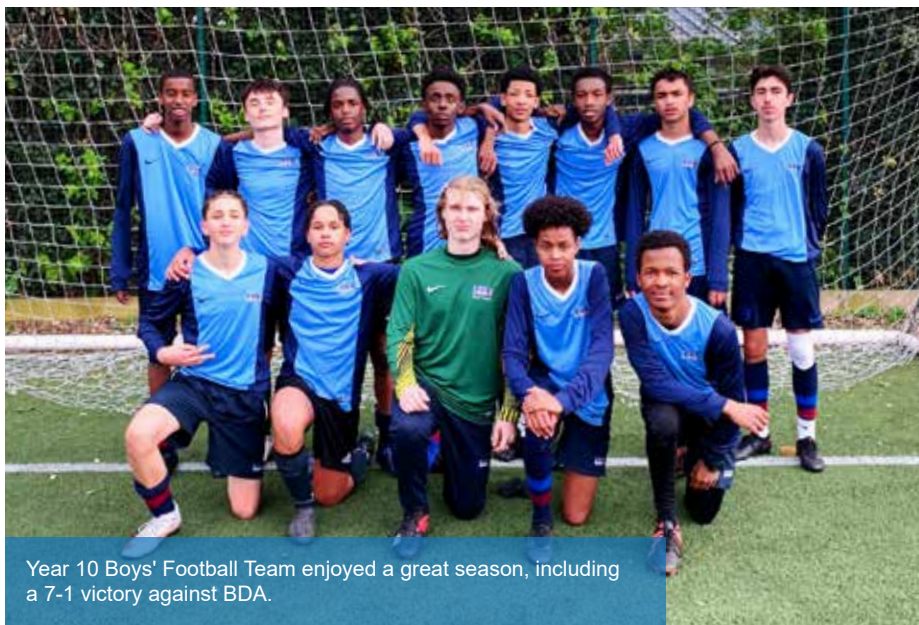
Year 10 Boys' Football Team enjoyed a great season, including a 7-1 victory against BDA.