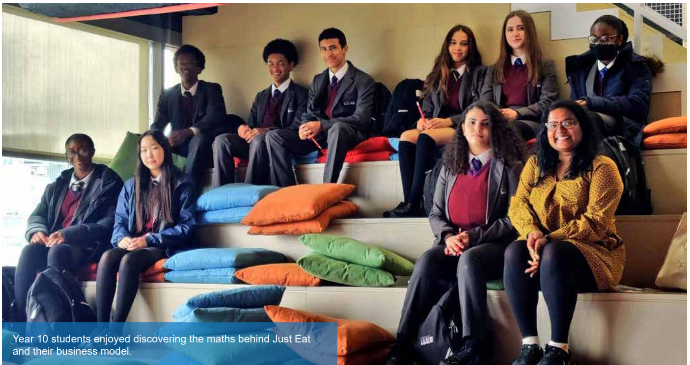
Year 10 students enjoyed discovering the maths behind Just Eat and their business model.

We were invited by the Advanced Maths Support Programme (AMSP) to a maths careers event held at the Just Eat offices on Fleet Street.