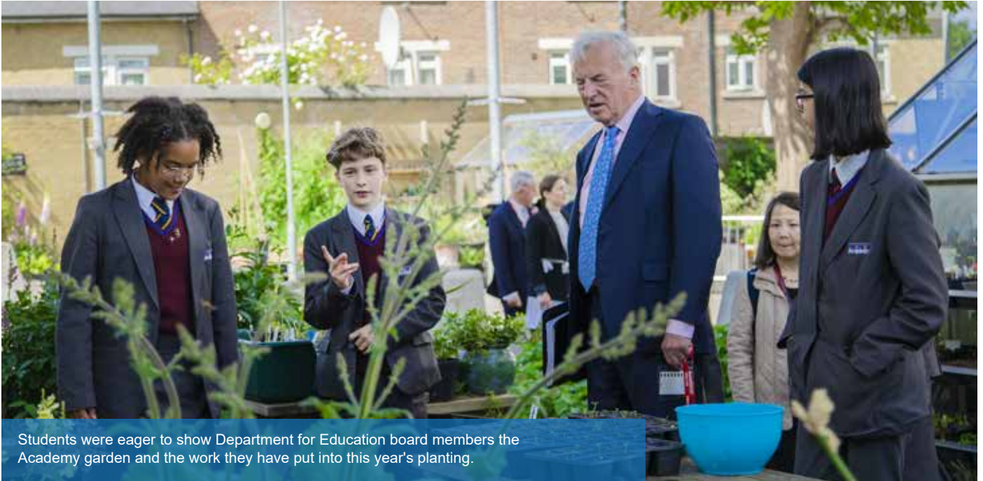
Students were eager to show Department for Education board members the Academy garden and the work they have put into this year's planting.

The Department for Education is responsible for education policy across England. Board members from the department were interested to head out into schools to see policy decisions in action and to ask students and staff about their experiences of school life.