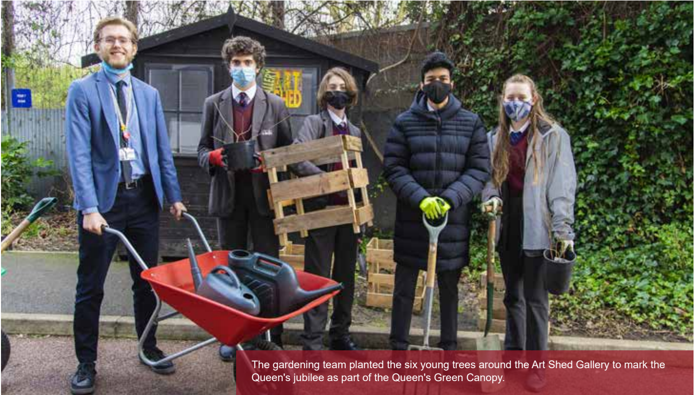
The gardening team planted the six young trees around the Art Shed Gallery to mark the Queen's jubilee as part of the Queen's Green Canopy.

YOUNG GARDENERS PLANT TREES TO MARK THE QUEEN'S JUBILEE AND INCREASE BIODIVERSITY.