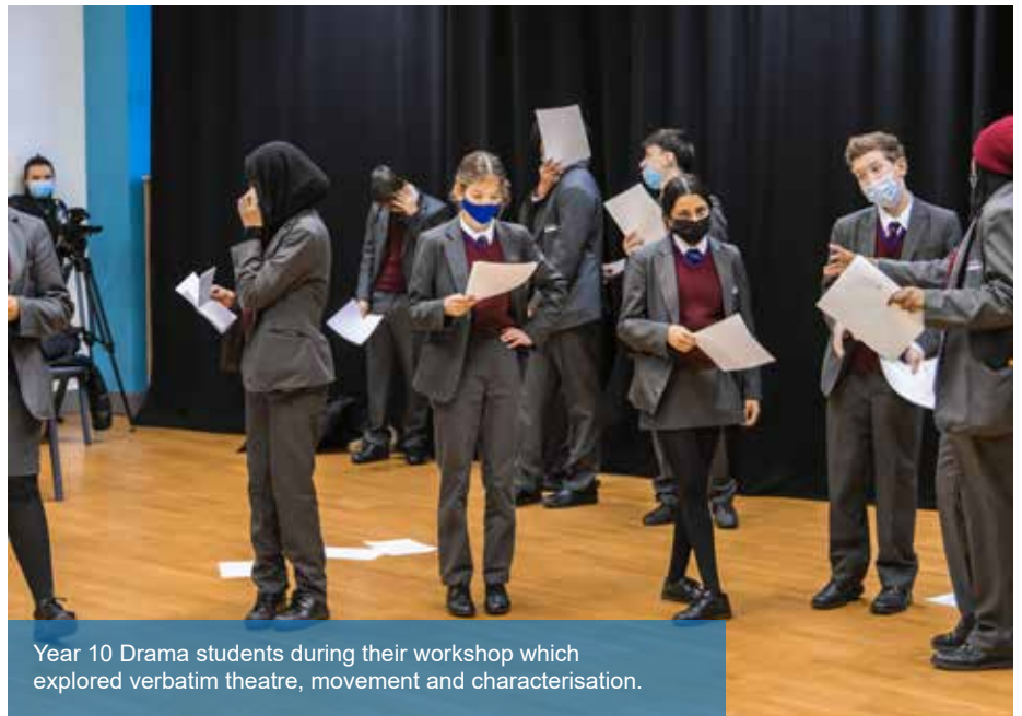
Year 10 Drama students during their workshop which explored verbatim theatre, movement and characterisation.

PAPER THEATRE DELIVERED A YEAR 10 GCSE DRAMA MASTERCLASS.