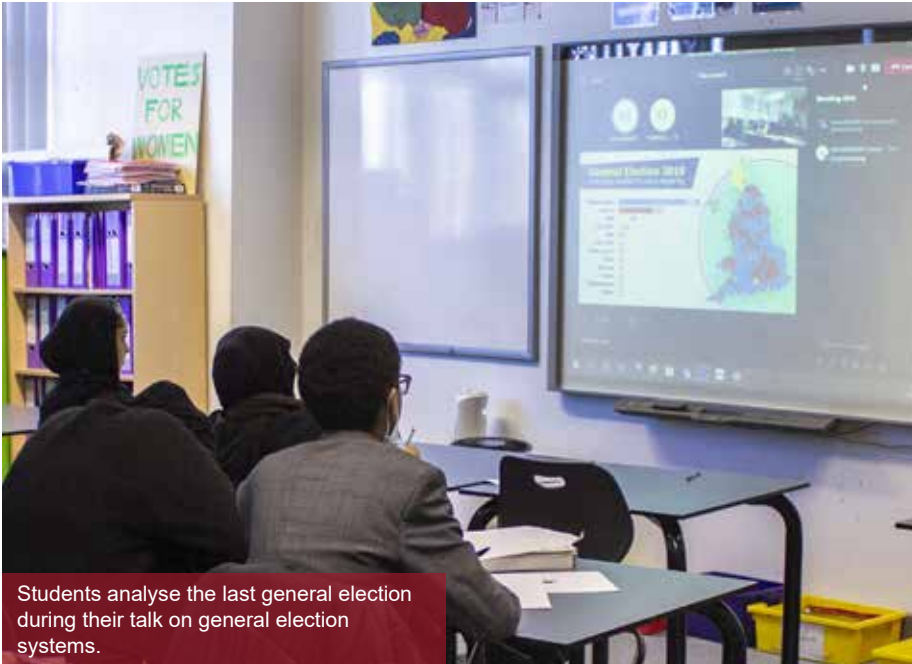
Students analyse the last general election during their talk on general election systems.

On Thursday 17 th March, Year 12 Government and Politics students were joined by two guest speakers from the UK Parliament Digital Sessions. The guests brought together students' knowledge on General Election systems and outcomes to consolidate their understanding. Students engaged in discussion about the strengths and weaknesses of the UK Parliament electoral system, known as 'First Past The Post', and explored the impact that this system has on the outcomes of our elections and the consequences this has for the nature of our democracy.