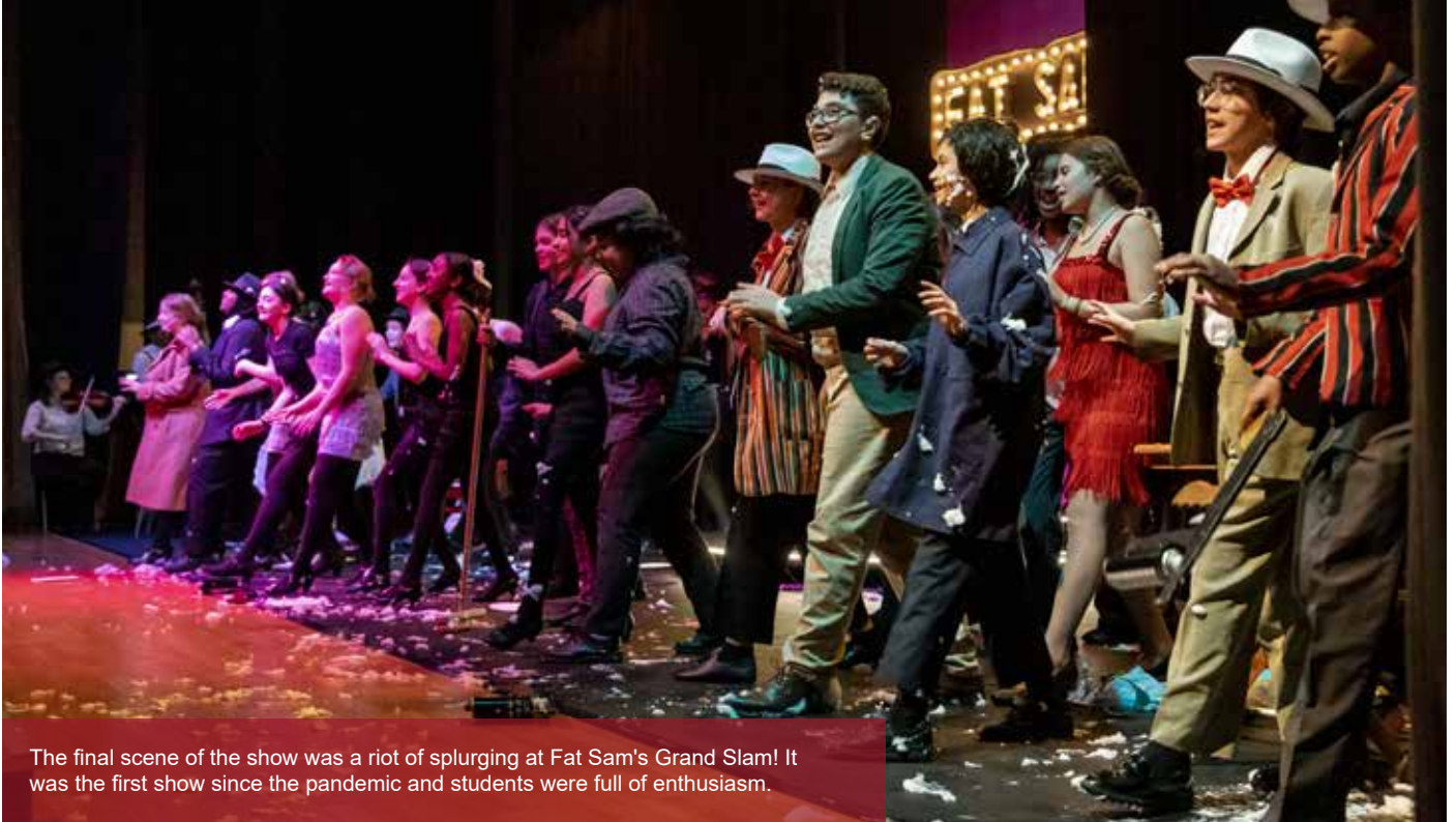
The final scene of the show was a riot of splurging at Fat Sam's Grand Slam! It was the first show since the pandemic and students were full of enthusiasm.

THE ACADEMY'S THEATRE WAS TRANSFORMED INTO A WORLD OF MASS SPLURGING, SPEAKEASIES, SINGERS, SHOWGIRLS AND HOODLUMS. MISS WILLIAMS TAKES US BACKSTAGE.