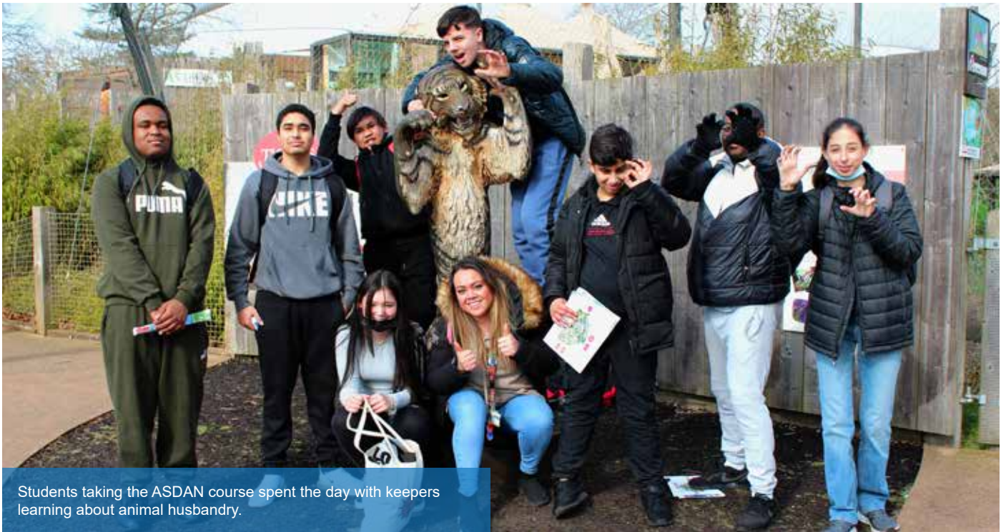
Students taking the ASDAN course spent the day with keepers learning about animal husbandry.

As part of the various enrichment courses run at Hammersmith Academy, a group of seven students spent the day at London Zoo to explore the incredible features of some of animals studied in the Animal Management ASDAN course.