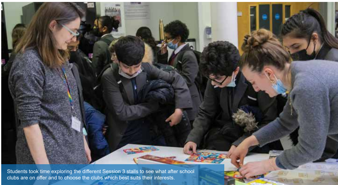
Students took time exploring the different Session 3 stalls to see what after school clubs are on offer and to choose the clubs which best suits their interests.

Extra-curricular enrichment forms a vital part of personal development. For students at Hammersmith Academy, the Session 3 after school clubs deliver a wide range of experiences to cater for all interest and tastes.