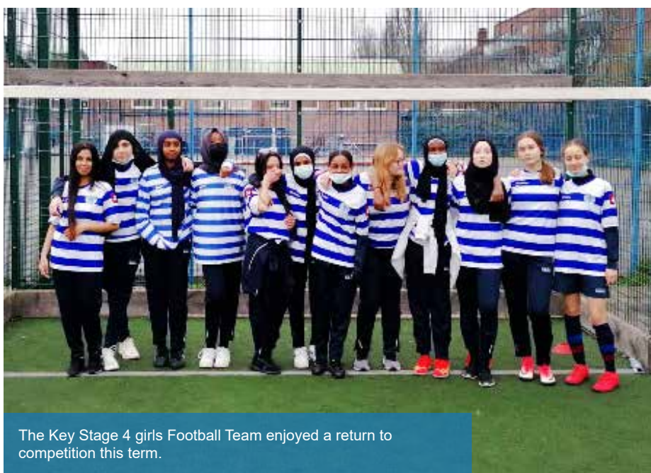
The Key Stage 4 girls Football Team enjoyed a return to competition this term.