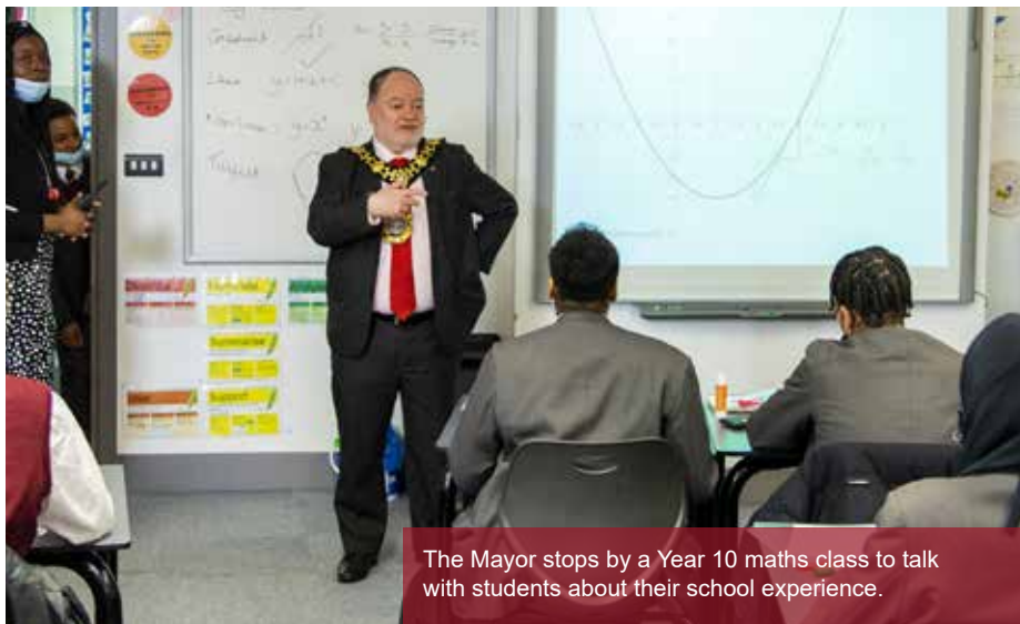
The Mayor stops by a Year 10 maths class to talk with students about their school experience.

THE MAYOR GAVE THANKS IN PERSON TO BOTH STUDENTS AND STAFF FOR THE WAY THEY OVERCAME THE CHALLENGES FACED IN THE LAST TWO YEARS.