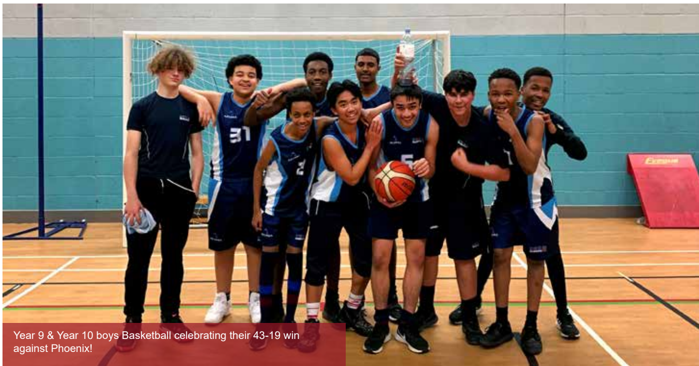
Year 9 & Year 10 boys Basketball celebrating their 43-19 win against Phoenix!

THIS TERM HAS BEEN A TYPICALLY BUSY ONE FOR THE SPORTS DEPARTMENT. HERE IS A ROUND-UP OF ALL THE SPORTING NEWS.