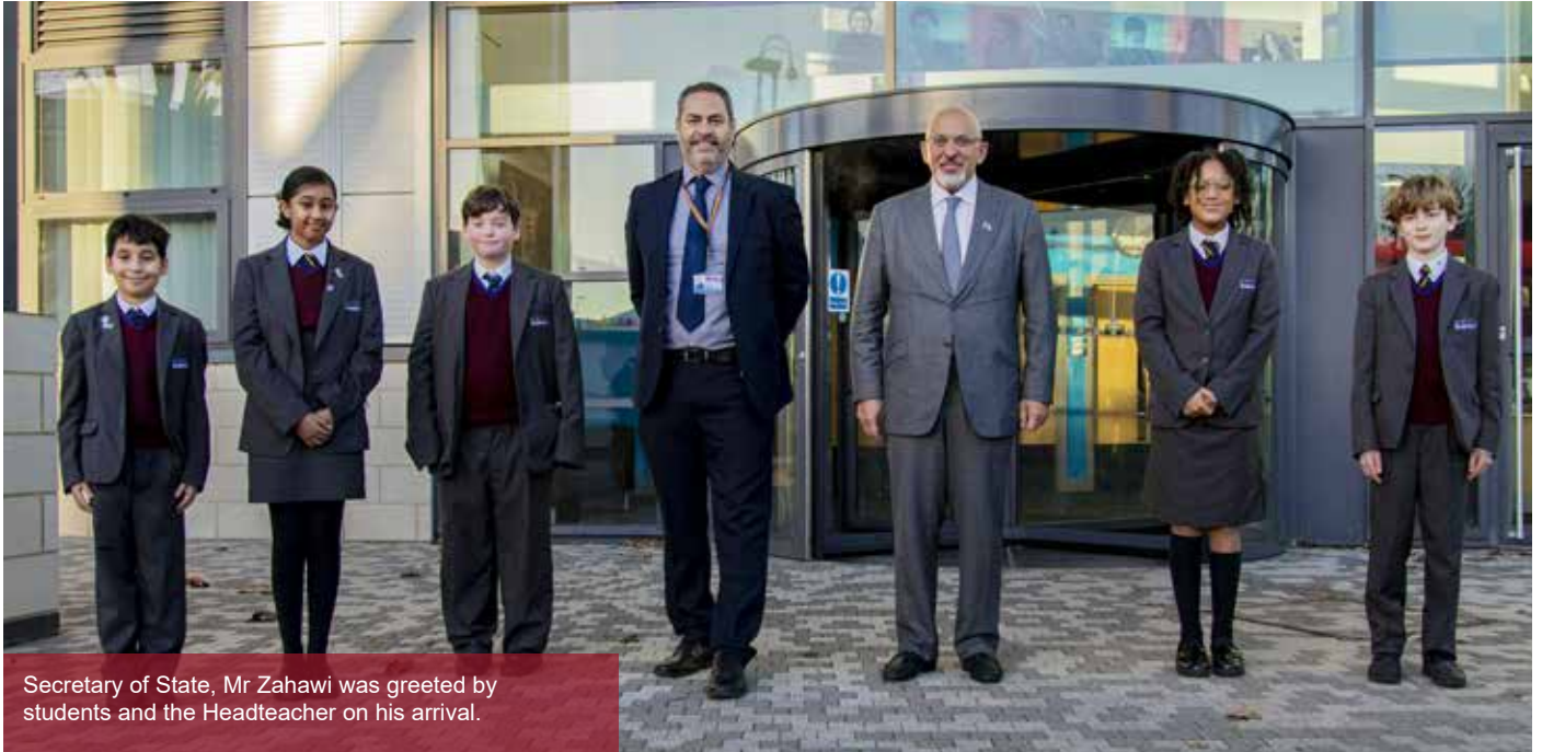
Secretary of State, Mr Zahawi was greeted by students and the Headteacher on his arrival.

Secretary of State for Education, Nadhim Zahawi, visited Hammersmith Academy to see how the Academy has been coping with the extra demands brought by the pandemic, such as the mass testing of students before their return to school in January and the wearing of facemasks.