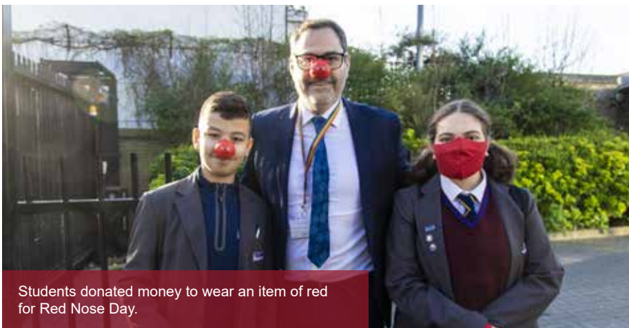
Students donated money to wear an item of red for Red Nose Day.

STUDENTS AND STAFF WORE RED TO RAISE MONEY FOR COMIC RELIEF.