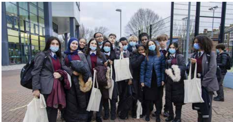
Students received a bag of revision guides and materials from the Academy before breaking up for the Christmas holiday.

GCSE AND A LEVEL STUDENTS GIFTED REVISION GUIDES FOR CHRISTMAS.