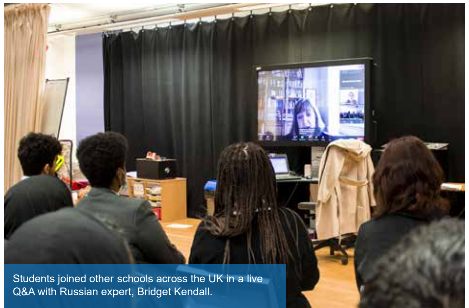
Students joined other schools across the UK in a live Q&A with Russian expert, Bridget Kendall.

STUDENTS WERE INVITED TO JOIN FORMER BBC DIPLOMATIC CORRESPONDENT AND RUSSIAN EXPERT, BRIDGET KENDALL IN A LIVE ONLINE Q&A.