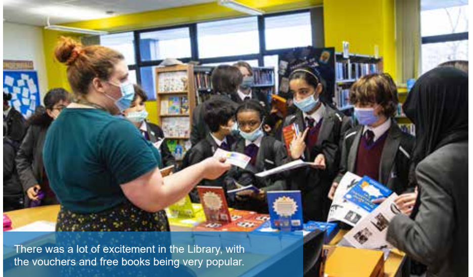
There was a lot of excitement in the Library, with the vouchers and free books being very popular.

March was also Women's History Month and to mark the occasion the Library's main display featured books by female authors or with strong female characters. ■