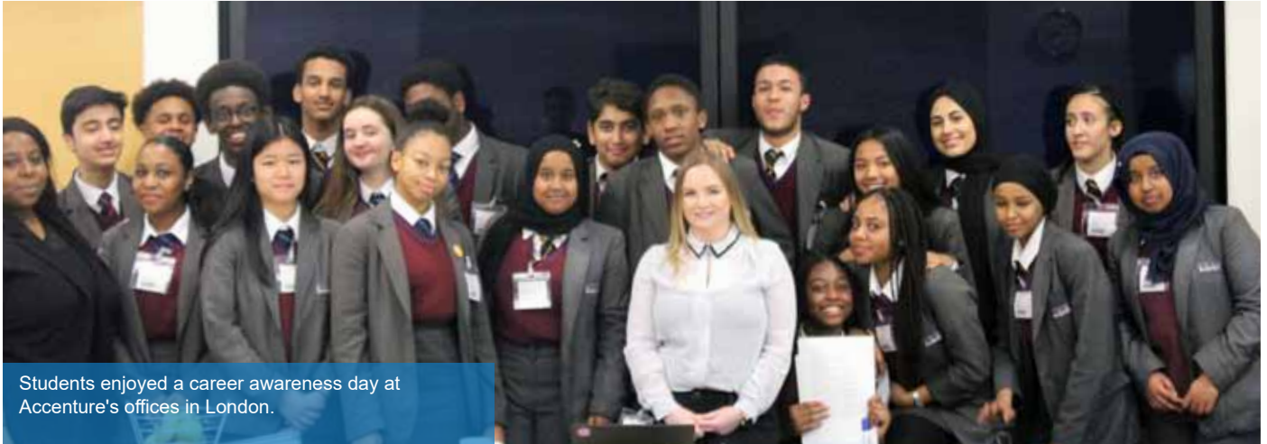
Students enjoyed a career awareness day at Accenture's offices in London.

THIS TERM A GROUP OF STUDENTS FROM YEAR 11 VISITED THE ACCENTURE OFFICES IN THE CITY. MS BALL REPORTS ON THE DAY.