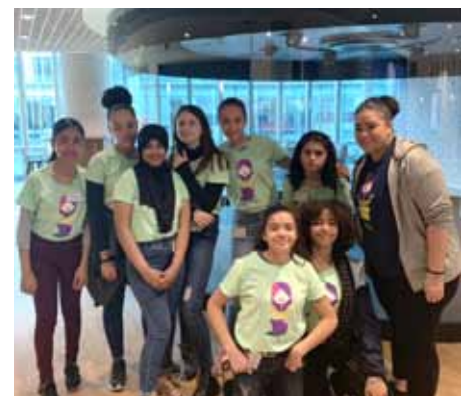
Team HA at Microsoft's headquarters in Paddington.

They did such a fantastic job with their design and presentation that they were awarded the prize for most innovative idea and best presentation. They were presented with a plaque to display back at school. Well done girls! ■