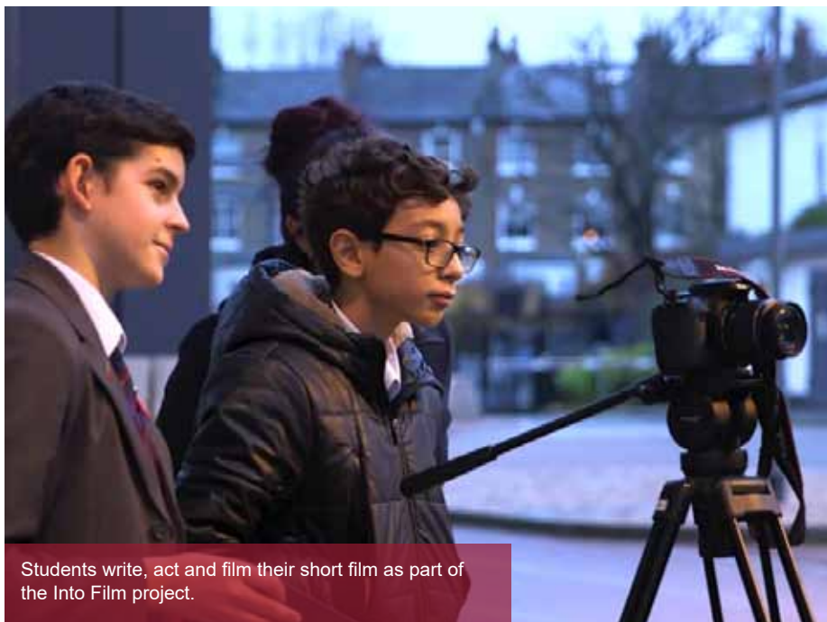
Students write, act and film their short film as part of the Into Film project.

Throughout the course of the Autumn Term, a group of Hammersmith Academy students took part in Into Film's Moving Minds project. The project's aim is to explore and promote mental wellbeing through the process of filmmaking.