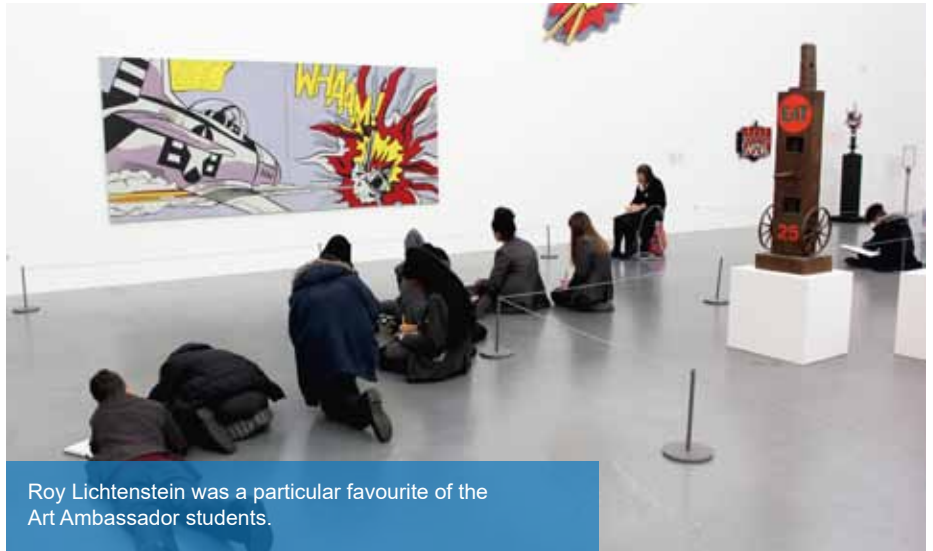
Roy Lichtenstein was a particular favourite of the Art Ambassador students.

Throughout the day, students had to complete an activity book using the influences from the different artists' work, which included Lichtenstein, Matisse and many others. ■