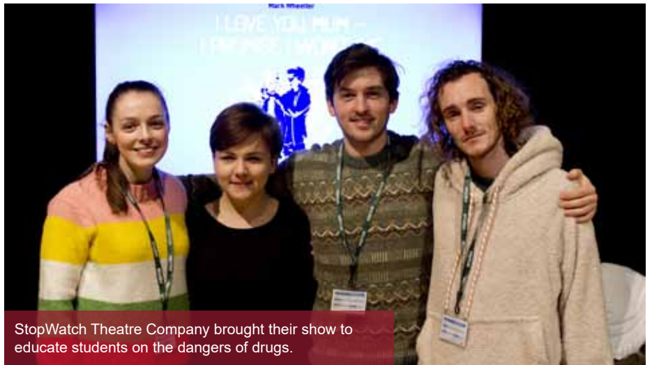
StopWatch Theatre Company brought their show to educate students on the dangers of drugs.

Students were moved by the loved ones' reactions and reflected on how easily people can lose their lives when taking illegal substances. ■