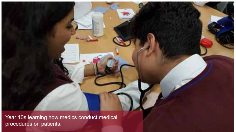
Year 10s learning how medics conduct medical procedures on patients.

YEAR 10 STUDENTS TOOK PART IN A MEDICAL CAREERS WORKSHOP AT KING'S COLLEGE LONDON AS PART OF NATIONAL CAREERS WEEK.