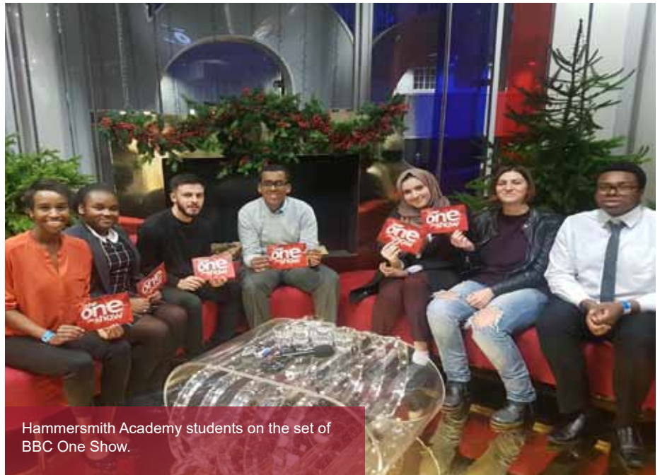
Hammersmith Academy students on the set of BBC One Show.