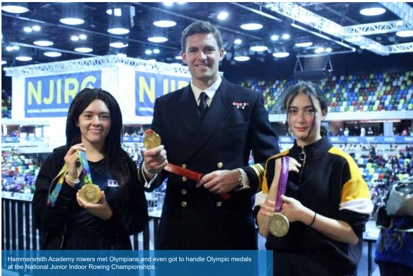
Hammersmith Academy rowers met Olympians and even got to handle Olympic medals at the National Junior Indoor Rowing Championships.

Run by London Youth Rowing, the event is a legacy of London's 2012 Olympic Games and is the biggest junior indoor rowing competition in the world.