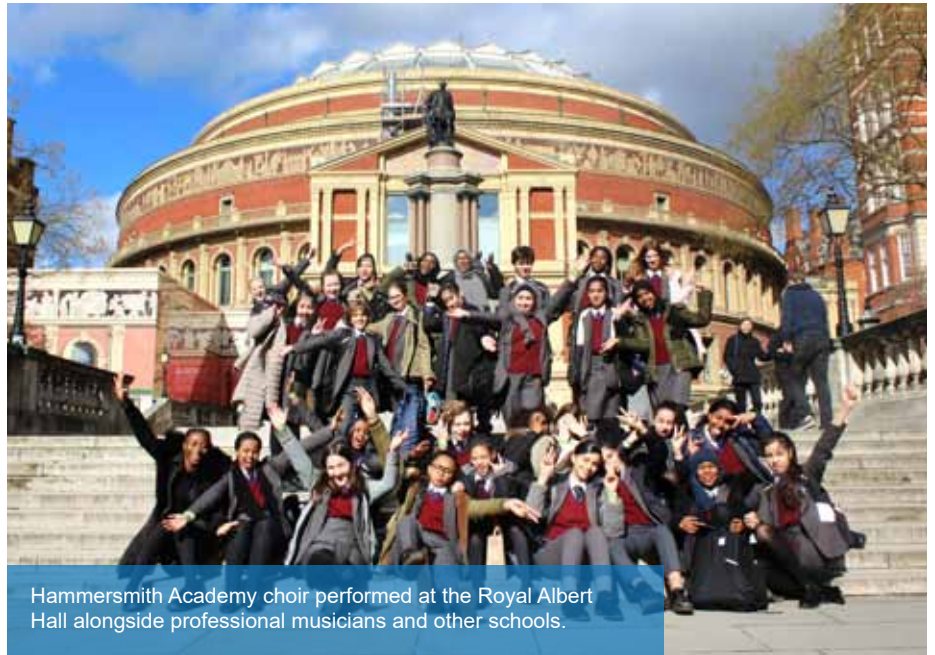
Hammersmith Academy choir performed at the Royal Albert Hall alongside professional musicians and other schools.