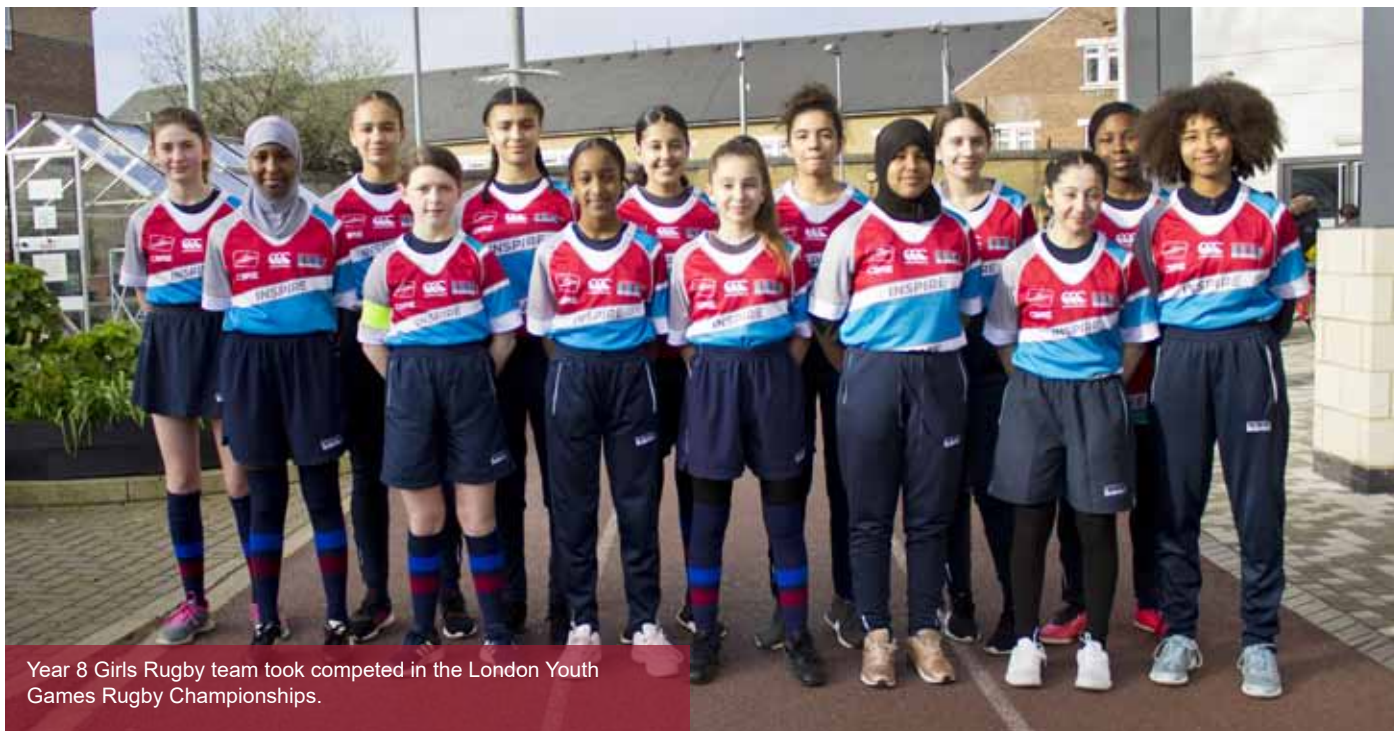
Year 8 Girls Rugby team took competed in the London Youth Games Rugby Championships.

THIS TERM HAS BEEN A TYPICALLY BUSY ONE FOR THE SPORTS DEPARTMENT. HERE IS A ROUND-UP OF ALL THE SPORTING NEWS.