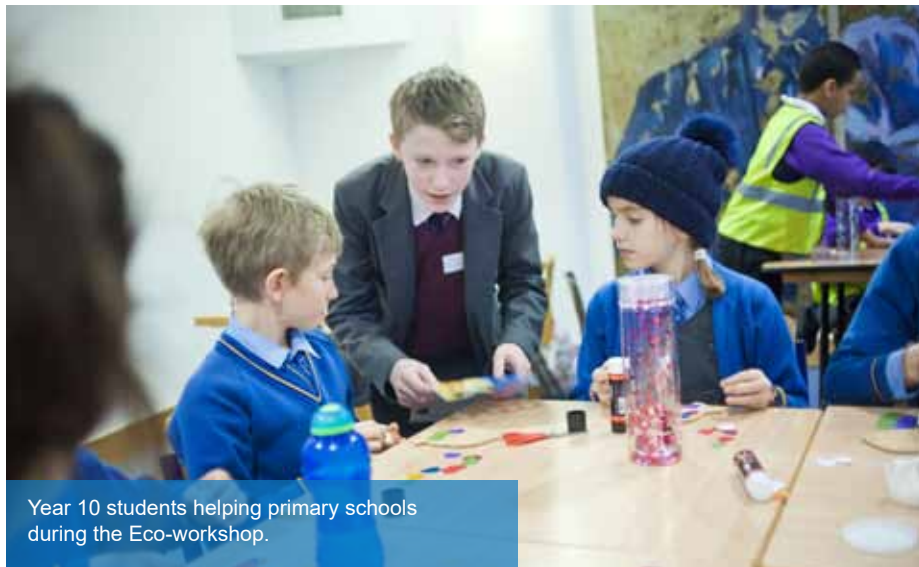
Year 10 students helping primary schools during the Eco-workshop.

THIS TERM HAMMERSMITH ACADEMY HAS BEEN INVOLVED IN A SCHOOL PARTNERSHIP PROGRAMME WITH ITS SISTER SCHOOLS.