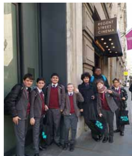
Students were at Regent Street Cinema to launch their film.