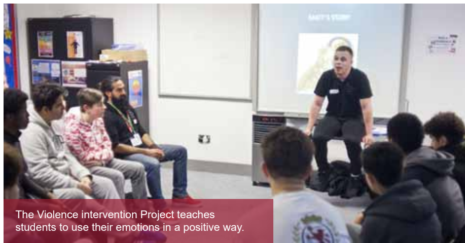
The Violence intervention Project teaches students to use their emotions in a positive way.

FRIDAY 1ST MARCH SAW THE WHOLE SCHOOL COME OFF TIMETABLE TO FOCUS ON STUDENT WELLBEING. MS GIKA EXPLAINS.