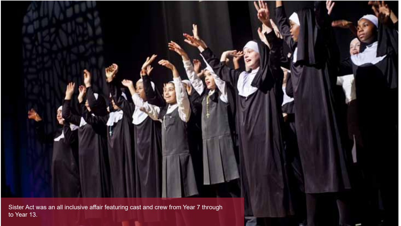
Sister Act was an all inclusive affair featuring cast and crew from Year 7 through to Year 13.