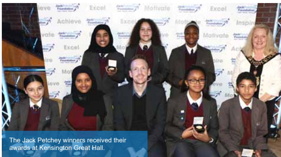
The Jack Petchey winners received their awards at Kensington Great Hall.

Students are nominated for a Jack Petchey Award based on their contribution to school life and their approach to academic studies.