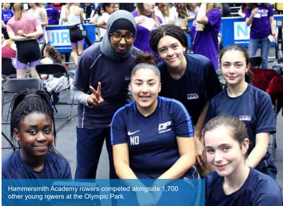
Hammersmith Academy rowers competed alongside 1,700 other young rowers at the Olympic Park.

On Friday 15 th March, Year 8 and Year 10 Academy rowers travelled to the Copper Box Arena in Stratford to compete against 1,700 young rowers.