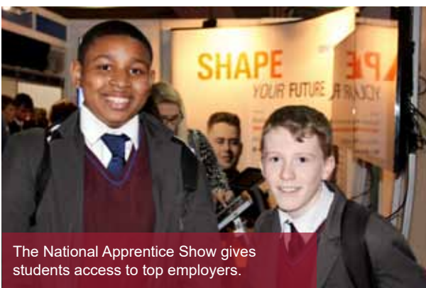
The National Apprenticeship Show gives students access to top employers.

The National Apprenticeship Show showcases over 100 employers and providers from across the UK. Year 10 students travelled to the event in Esher to discover what future careers might appeal to them.