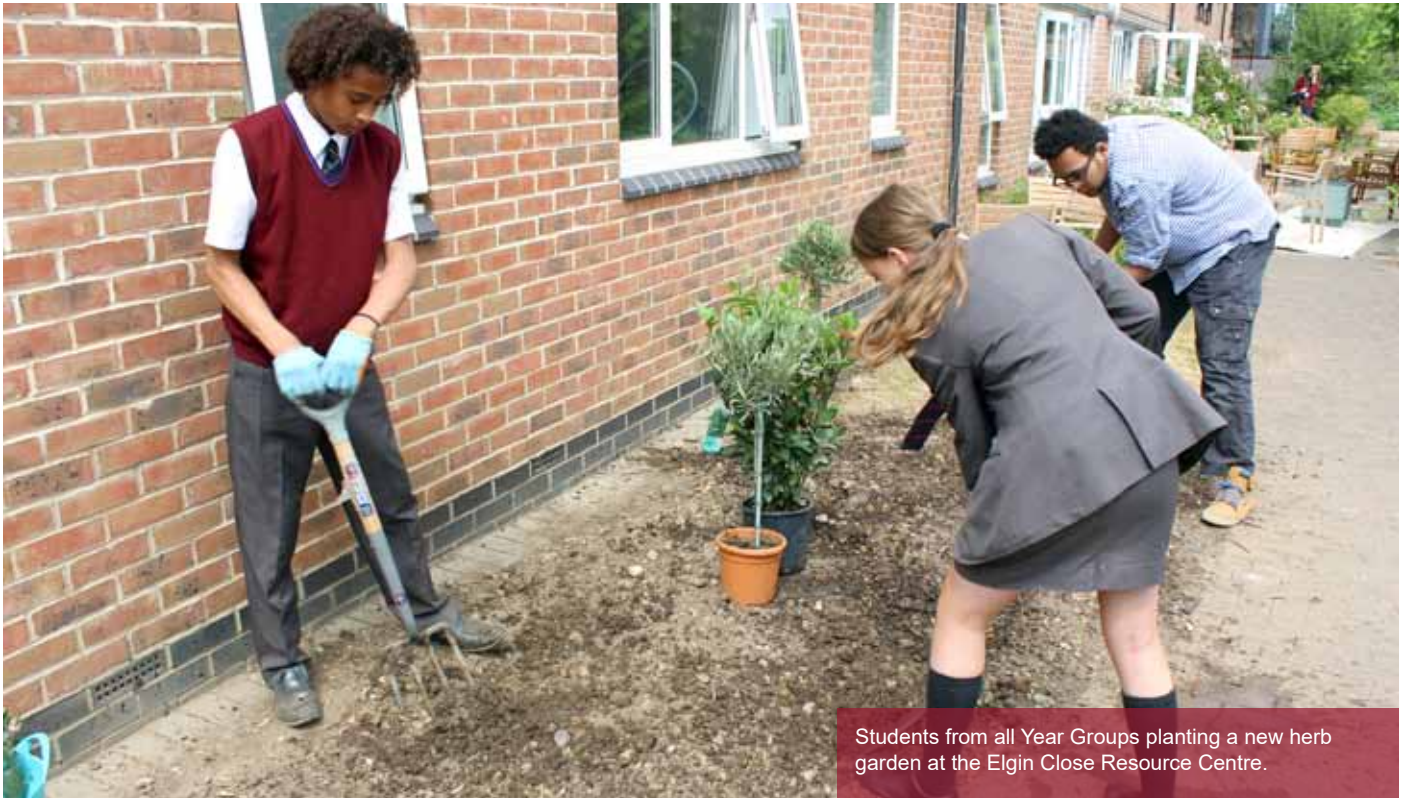
Students from all Year Groups planting a new herb garden at the Elgin Close Resource Centre.