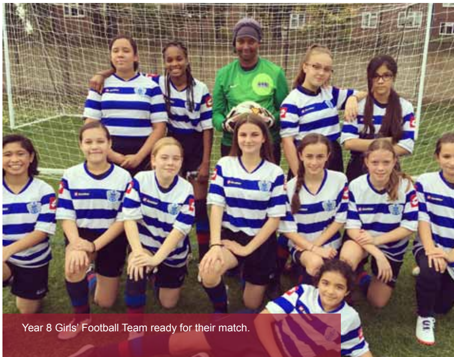
Year 8 Girls' Football Team ready for their match.

THIS TERM HAS BEEN A TYPICALLY BUSY ONE FOR THE SPORTS DEPARTMENT. HERE IS A ROUND-UP OF ALL THE SPORTING NEWS FROM THIS TERM.