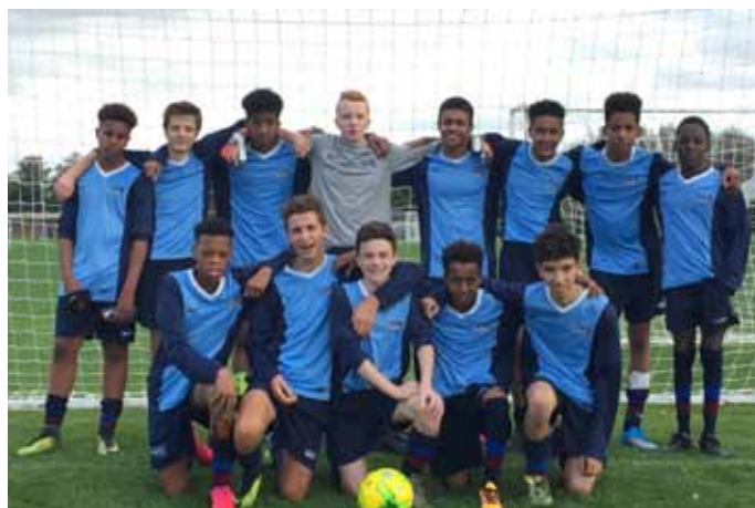
The Year 10 football team have notched up some impressive victories this term.