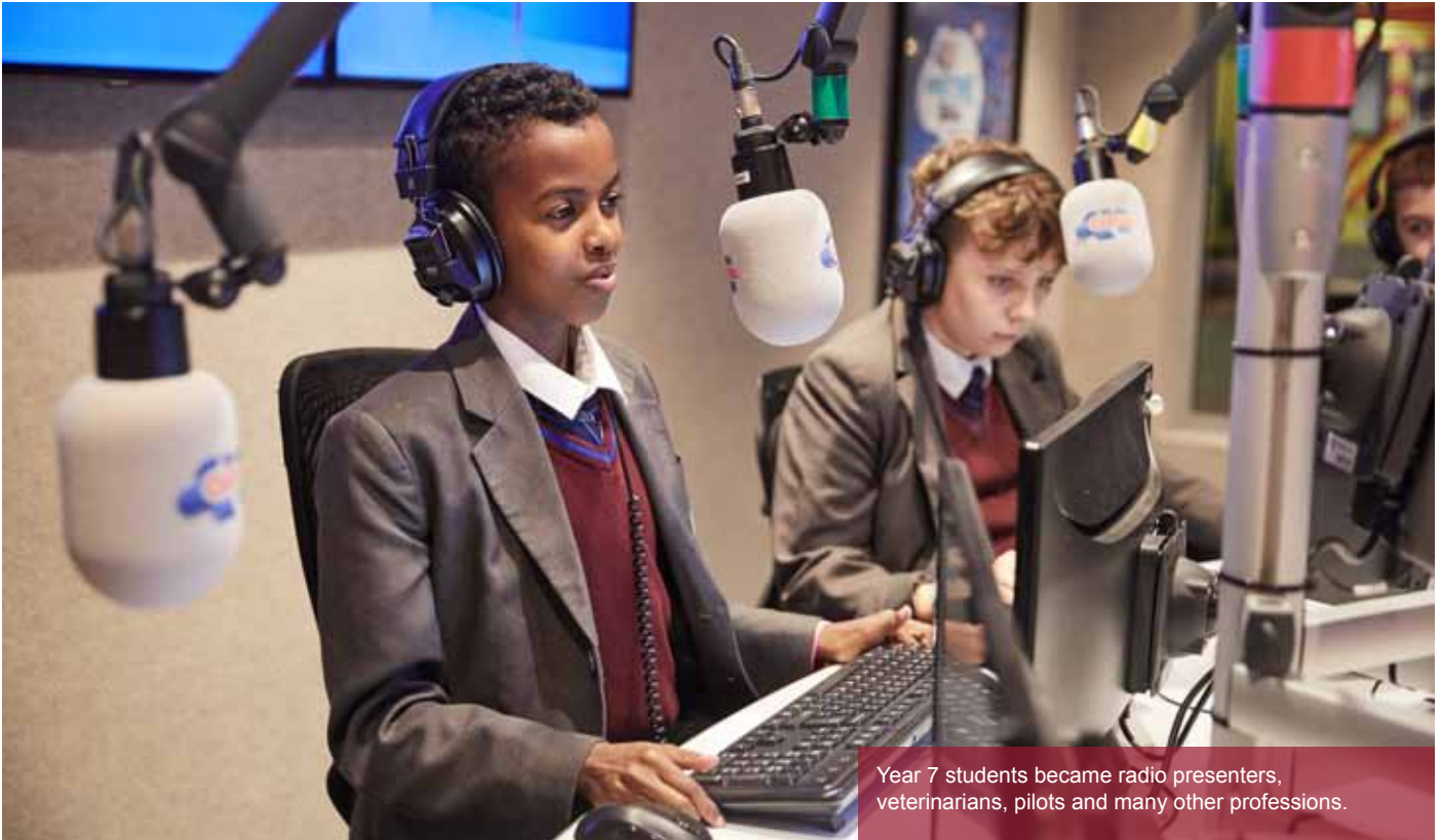
Year 7 students became radio presenters, veterinarians, pilots and many other professions.