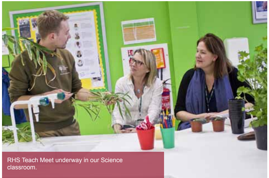
RHS Teach Meet underway in our Science classroom.

HAMMERSMITH ACADEMY HOSTED ITS FIRST ROYAL HORTICULTURAL SOCIETY TEACH MEET SESSION IN NOVEMBER.