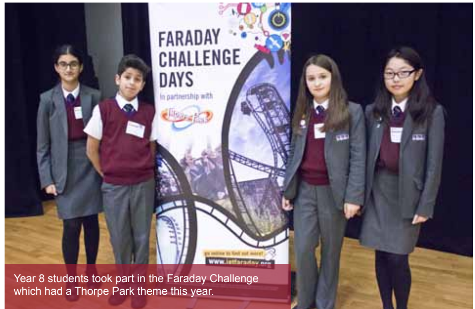
Year 8 students took part in the Faraday Challenge which had a Thorpe Park theme this year.

Students were asked to design a brand new attraction for Thorpe Park by the park's head engineer. Each team was allocated Faraday currency from which to purchase materials and build a prototype. At the end of the event, the teams had to present their design idea and prototype to a