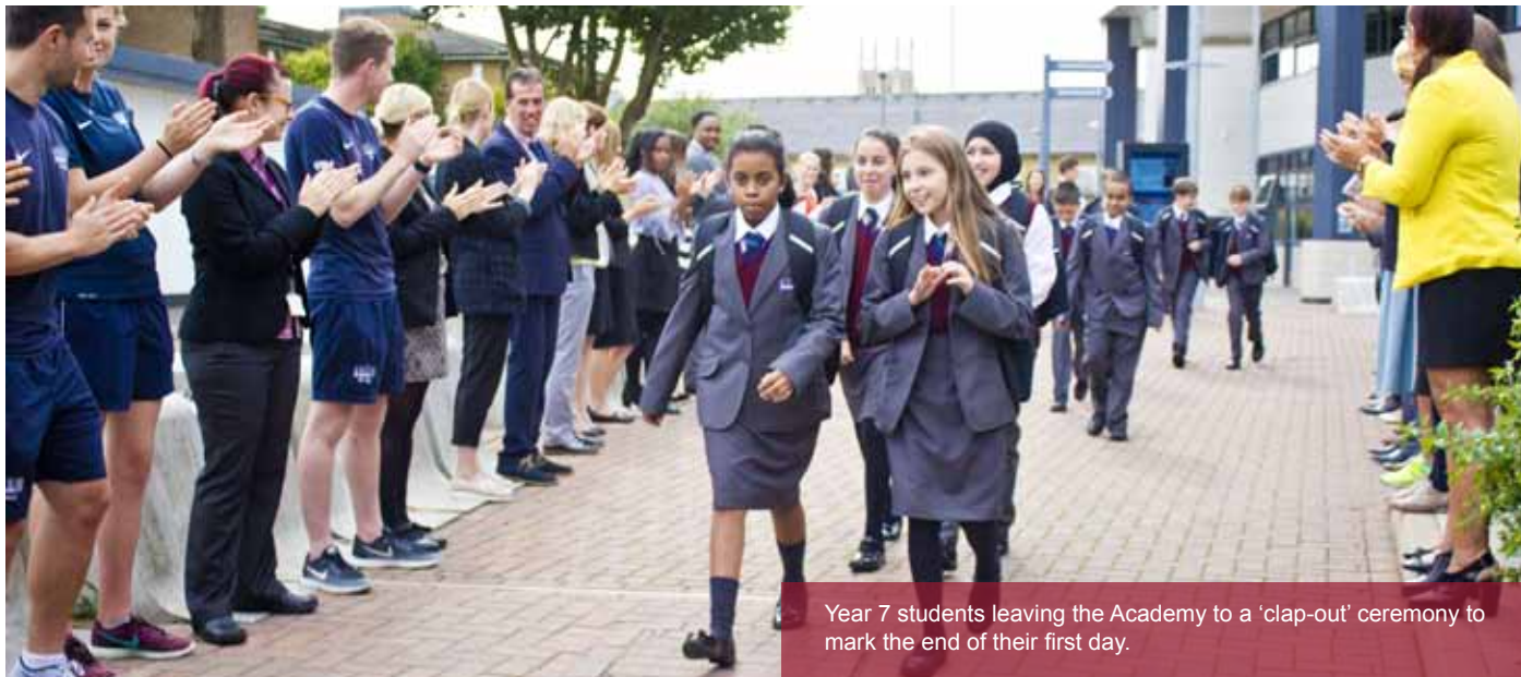
Year 7 students leaving the Academy to a 'clap-out' ceremony to mark the end of their first day.

A STUDENT'S FIRST DAY AT SCHOOL IS ALWAYS ONE TO REMEMBER. HERE AT THE ACADEMY THE FIRST DAY MARKS THE START OF A LIFE CHANGING JOURNEY.