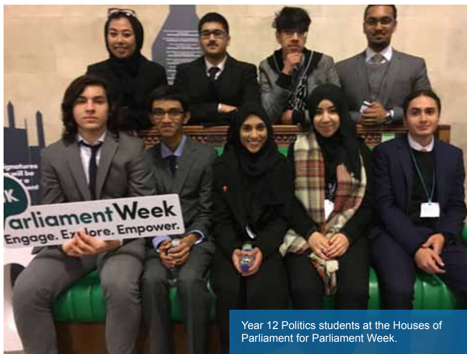
Year 12 Politics students at the Houses of Parliament for Parliament Week.