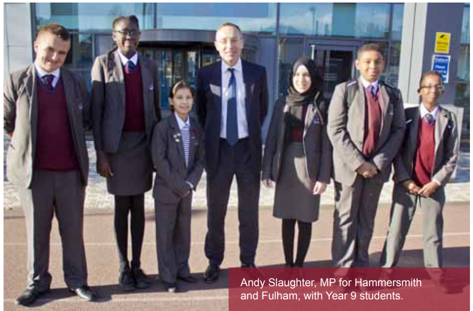
Andy Slaughter, MP for Hammersmith and Fulham, with Year 9 students.

At the end of the talk, students were invited to put questions forward to Mr Slaughter and no topic was out of bounds. Students raised a number of difficult topics, asking why young